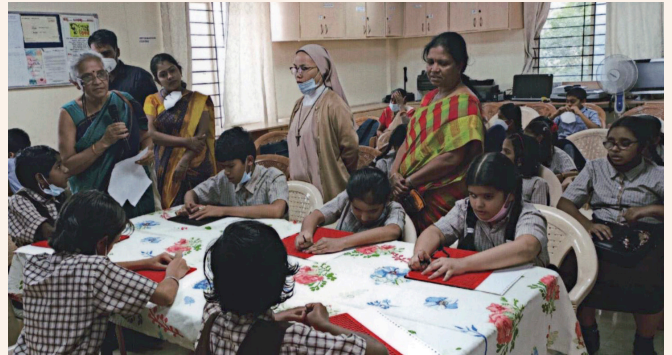
Braille Competition for Visually Impaired students.