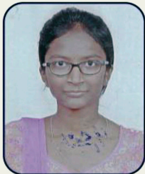
Prerana E.C. 90%