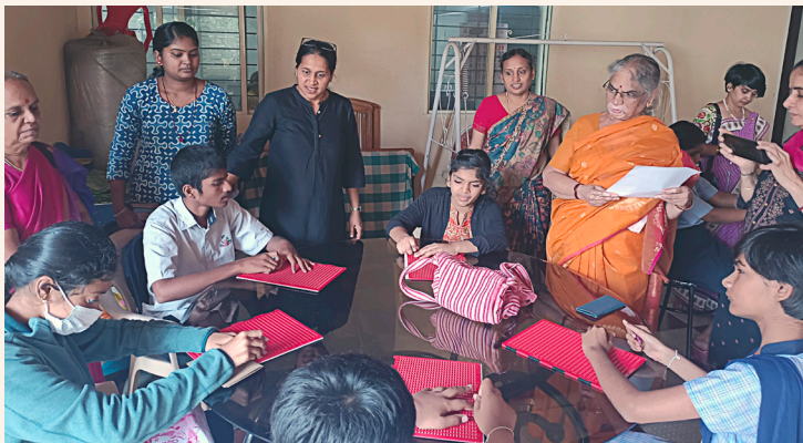
Braille Reading Competition