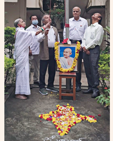
Independence Day Celebration-2022.

The cultural programmes were rendered by the children of Day Care Centre, staff members of the Hospital and Society