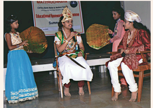
Cultural event by Education Sponsored Children.

Please encourage 'Go Green' initiative. Provide your E-mail ID , so that we can mail the Newsletter. mathruchayam@gmail.com Ph: 080-2671 3421