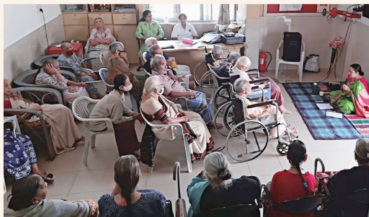
Inmates of Geriatric Care Centre at the Music Programme.