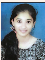
P.S. Nayak Memorial Award 1st Rank Holder in B.Com.-Economics - Canara First Grade College, Mangalore