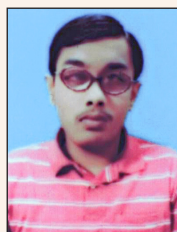
A. Venkataramana Setty Memorial Award Highest Marks in SSLC - Among Blind Students

Canara Bank Relief & Welfare Society has instituted cash awards of Rs.5,000/- each, in memory of persons, who have played an appreciable role in the development of society. Merit awards were given to the following students for the academic year 2021-22.