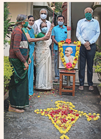
Republic Day Celebration-2022.