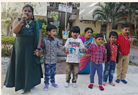
Entertainment programme by children of Day Care Centre.