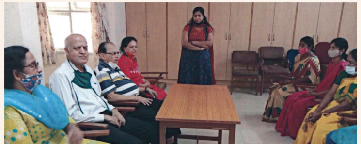
Staff and committee members interacting with Trainees

33 ladies were trained under the HHCH Training Programme during the period from December 2020 to July 2022. All of them were placed for taking care of the elderly in different houses.