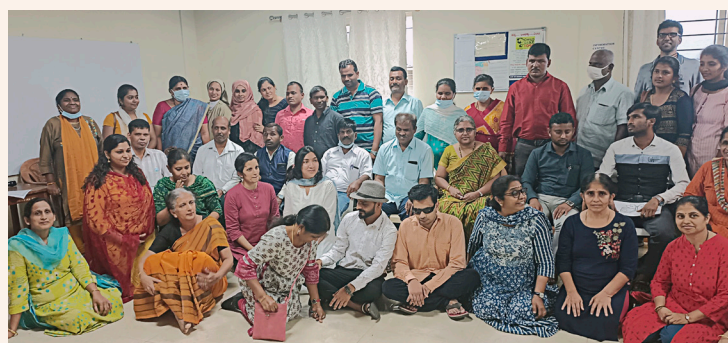
Training Programme - Participants & Teachers