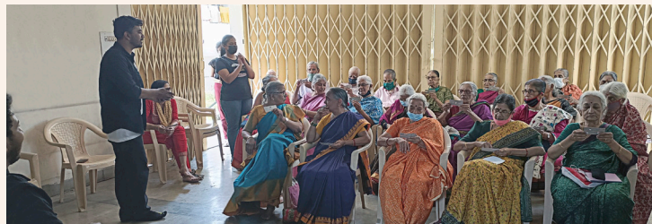
The students of Dayananda Sagar Engineering College, Bangalore conducted different types of activities for residents of Elders' Home.