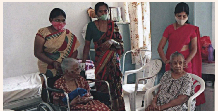
Training at Sevashetra Hospital