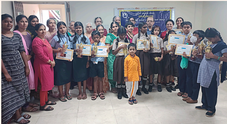
Prize winners along with volunteers