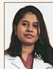
C. Eknath Kamath Memorial Award 1st Rank Holder in B.Sc. Nursing - Rajiv Gandhi University of Health Sciences