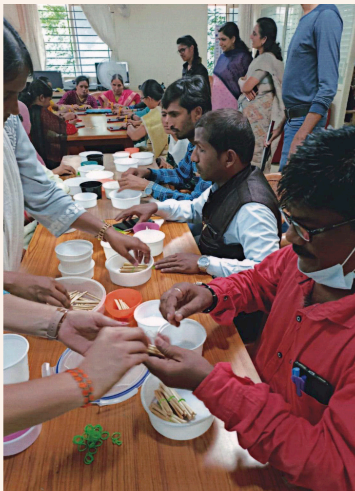
Teachers Training Programme at BRC - Practical Session