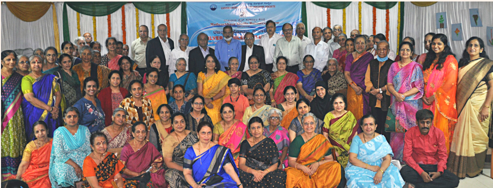
Silver Jubilee Celebration of BRC - Volunteers, Governing Council Members & Staff.