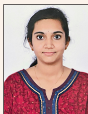
A. Damodar Pai Memorial Award 1st Rank Holder in M.B.B.S - Rajiv Gandhi University of Health Sciences