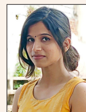
S. R. Prabhu Memorial Award 1st Rank Holder in Master of Social Work - Bangalore University, Bangalore