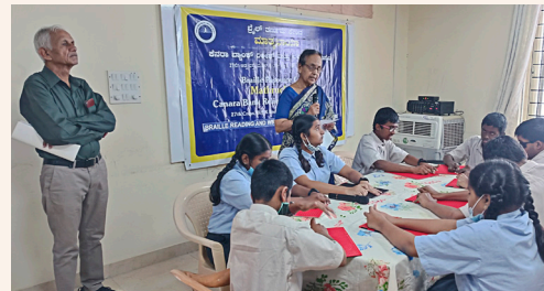
Braille writing competition

Mathru Education Trust for the Blind & Disabled, Bengaluru and KWAB, Bengaluru participated in the competitions.