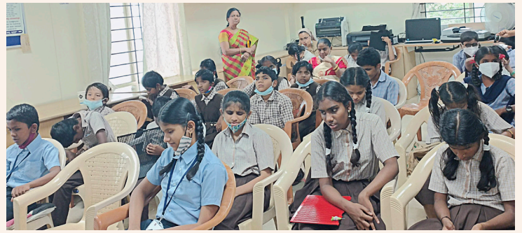
Braille writing competition