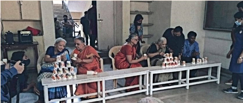
Competitions for Residents of Elders' Home.