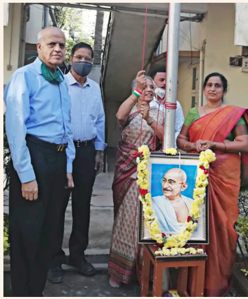
Republic Day Celebration-2021.

An Entertainment program was conducted by the children of Day Care Centre.