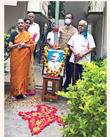
Independence Day Celebration-2021.