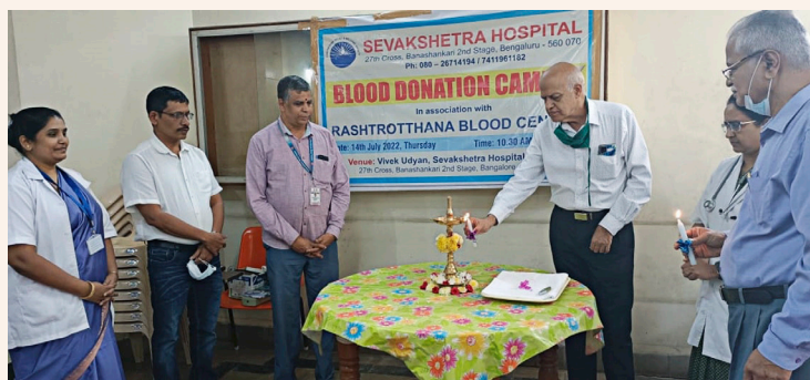
Inauguration of Blood Donation Camp

Rashtrorothana Blood Centre lauded the initiative and social concern of the staff of Sevashetra Hospital and issued a Letter of Appreciation.