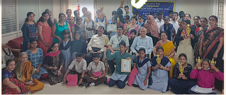
Winners and participants of Braille Reading, Writing, Pick & Speak competition.