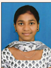
B. Ratnakar Memorial Award 1st Rank Holder in Bachelor of Social Work - Mangalore University

Mathru Education Trust for Blind, Bengaluru